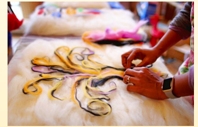
Examples of artistic activities (Group 1 intake)