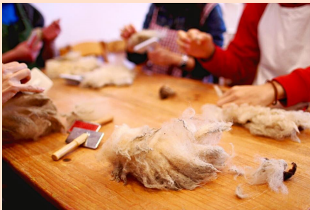
Images of our Group 1 students undertaking artistic activities training.